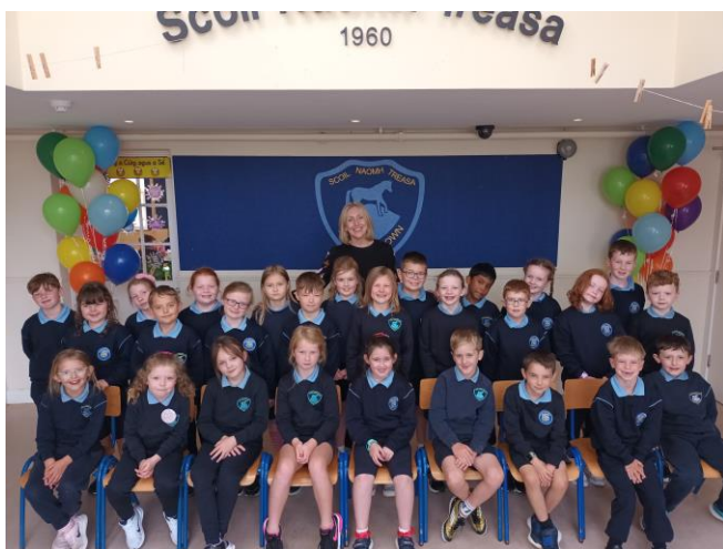
3 rd & 4 th Class 2024