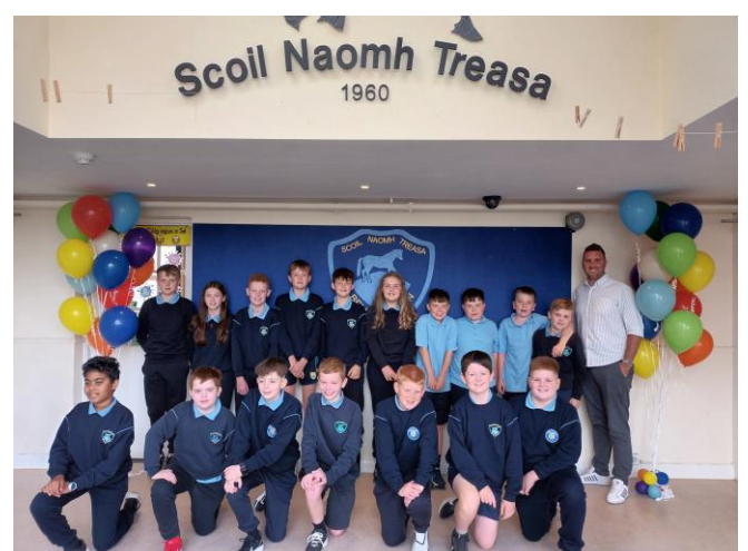
5 th & 6 th Class 2024