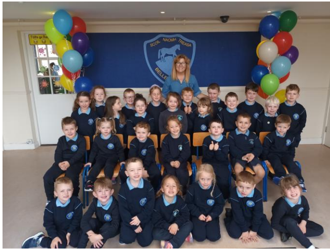
Junior & Senior Infants 2024