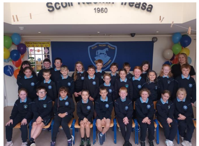
1 st & 2 nd Class 2024