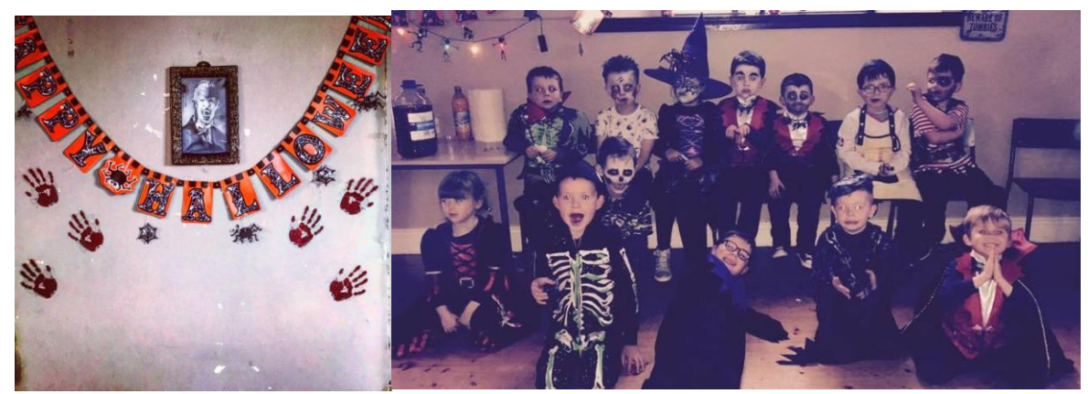
HALLOWEEN DISCO - Halloween fancy dress disco organised in Parish Hall. Parish hall was suitably decorated, Professional DJ & Treats supplied. Everyone made a massive effort. Thank you.