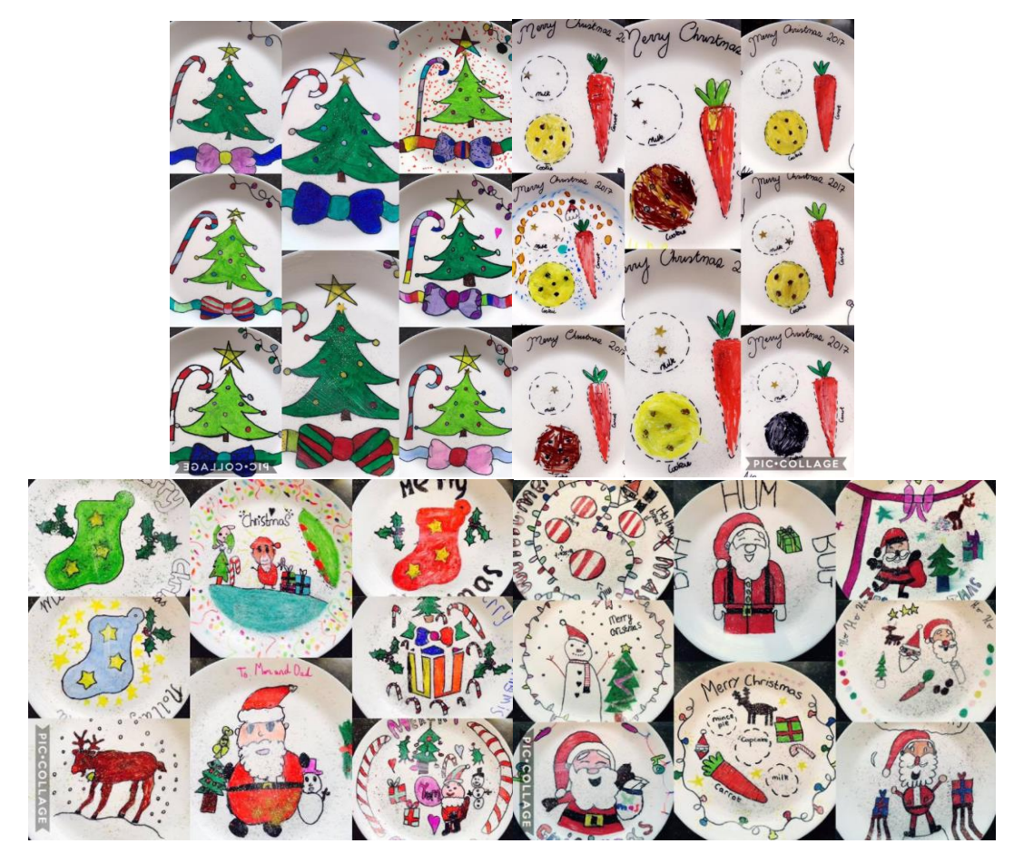
CHRISTMAS GIFTS - This year the children decorated their own plates. We designed a template on the plates for the younger kids to work from and 2^{nd} - 6^{th} class designed their own. Plates were then sealed and sprinkled with glitter by PC. Beautiful little keepsakes.