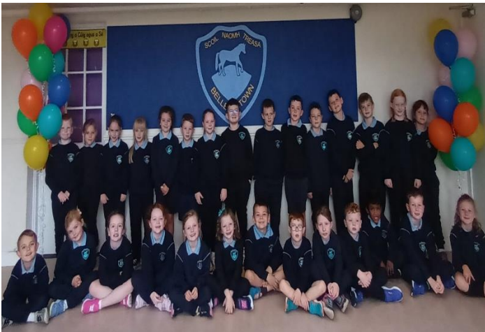
1 st & 2 nd Class 2023