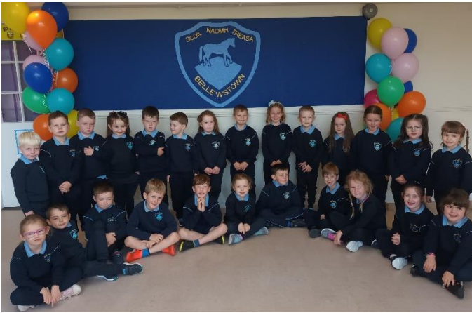
Junior and Senior Infants 2023