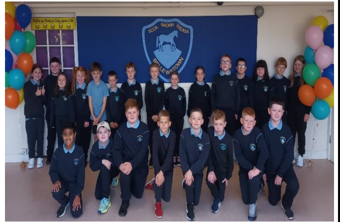
3 rd & 4 th Class 2023