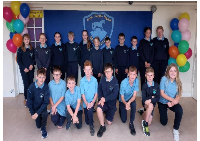
5 th & 6 th Class 2023